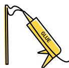
INSTALLATION WITH GLUE